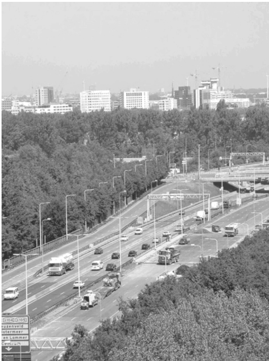
Construction of double layer porous asphalt on ring road of Amsterdam

The needs for transportation and for living in a silent environment have been in conflict for many years now in the densely populated Netherlands. The Dutch policy to reduce noise nuisance has been focused on noise abatement at the source since the Noise Nuisance Act was erected in the late 70's. Source measures comply with the general environmental rule “to prevent is better than to cure”, and, not the least reason for their success, source measures are cost-effective. In this paper the present situation of applying low-noise techniques in the Netherlands are discussed.