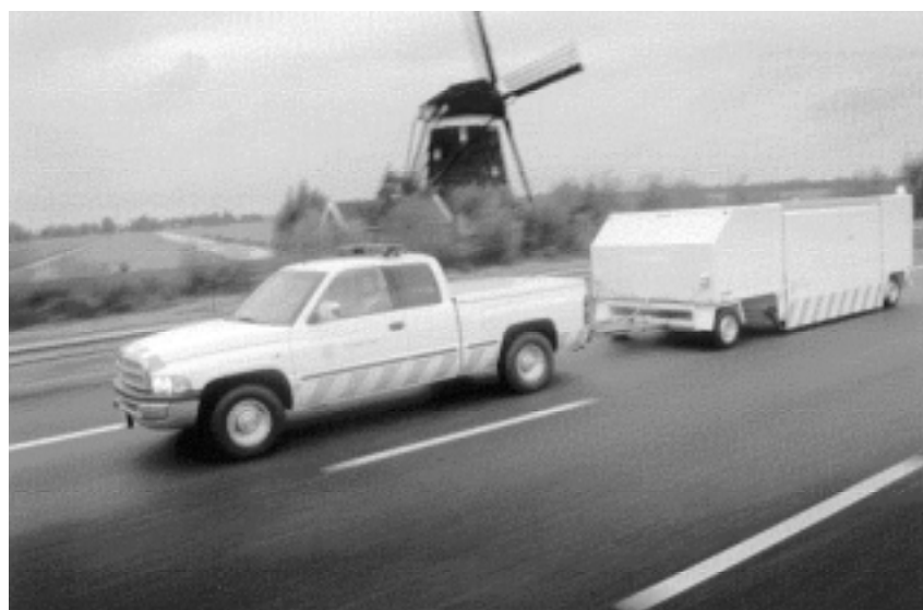
ROEMER of DWW measures tyre/road noise on Dutch highways

The Ministry of Transport, Public Works and Water Management and the Ministry of Public Housing, Spatial Planning and Environmental Conservation together erected a broad innovation program (IPG) to handle the noise situation around the Dutch highways and railway lines [1]. Major effort will be put into innovative solutions for noise abatement at the source, including development of a third generation of silent road surfaces, special attention to the developments of silent tyres and vehicles, application of source measures on railroad yards and more efficient screening. For road traffic noise a noise reduction of 8 dB(A) with respect to the actual situation will be feasible at locations where innovative solutions are combined.